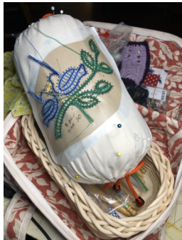
My tiny Italian pillow with a small Idrija project. Something to get done in just two days.