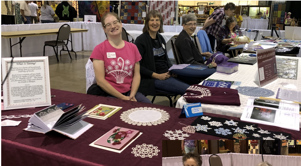
Sunday at the State Fair.