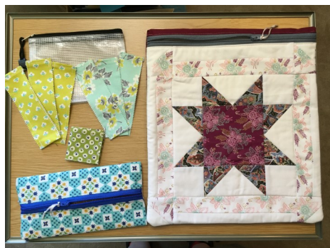
Quilt block sampler made into zipper bags.