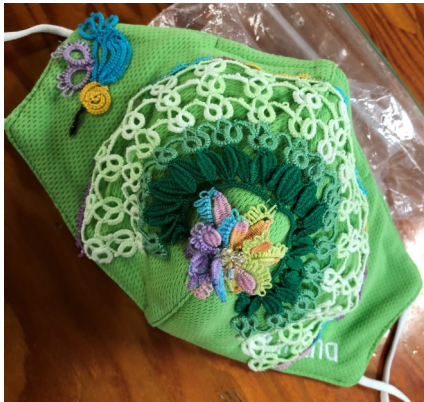
Those of us who went to Shuttlebirds last time will recognize the flower, fan and hummingbird patterns we learned there.