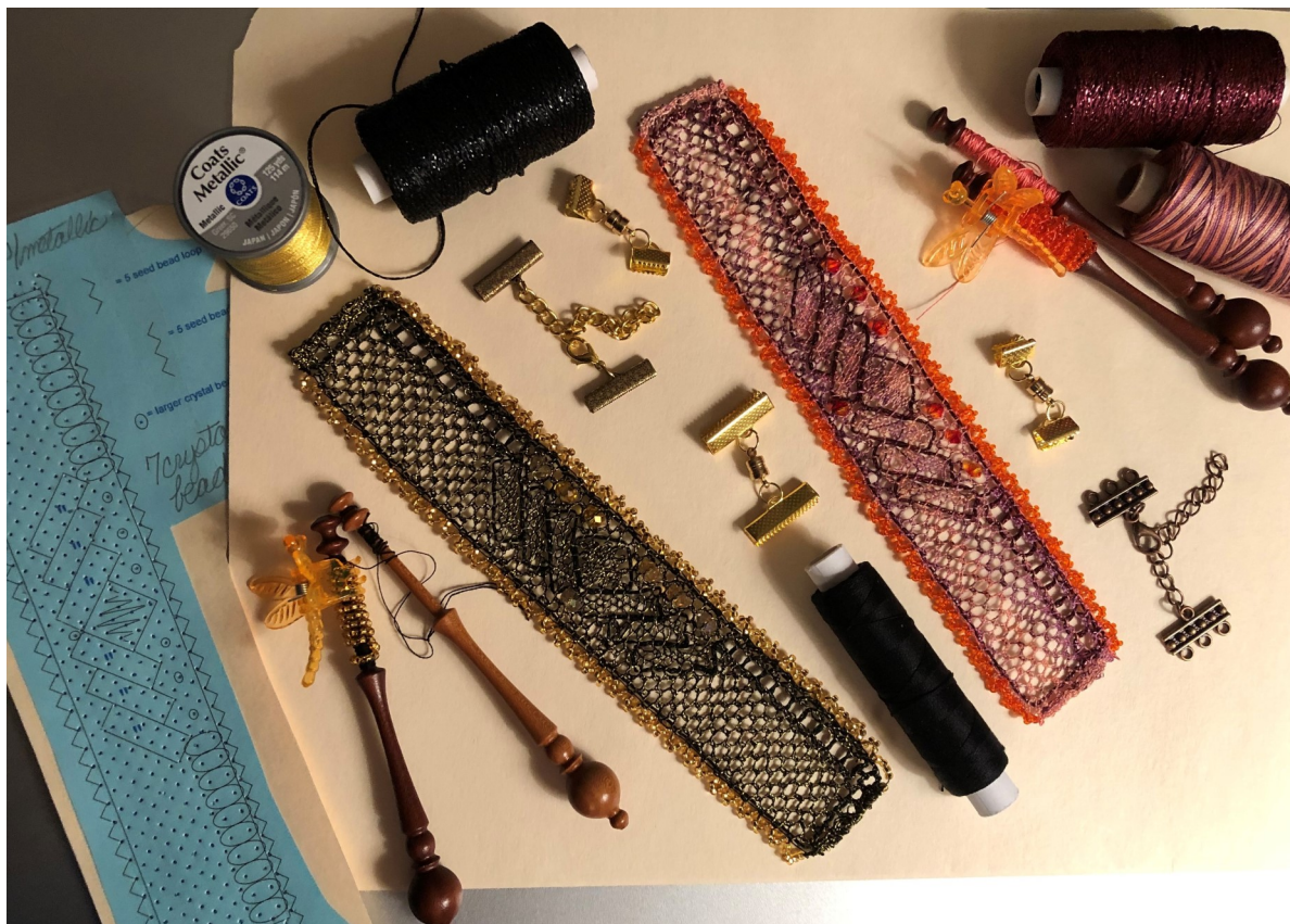
This design will be on the IOLI Pattern Disk.