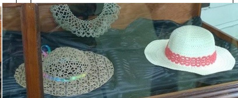
Everyone liked the hats.